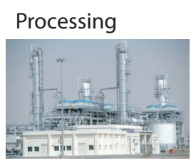
Heat, Physical Waste