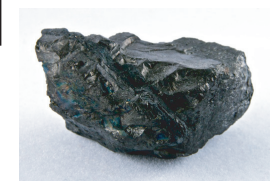
Fossil Fuels - Coal Shell Oil Company